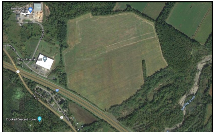
Overhead View of the Property